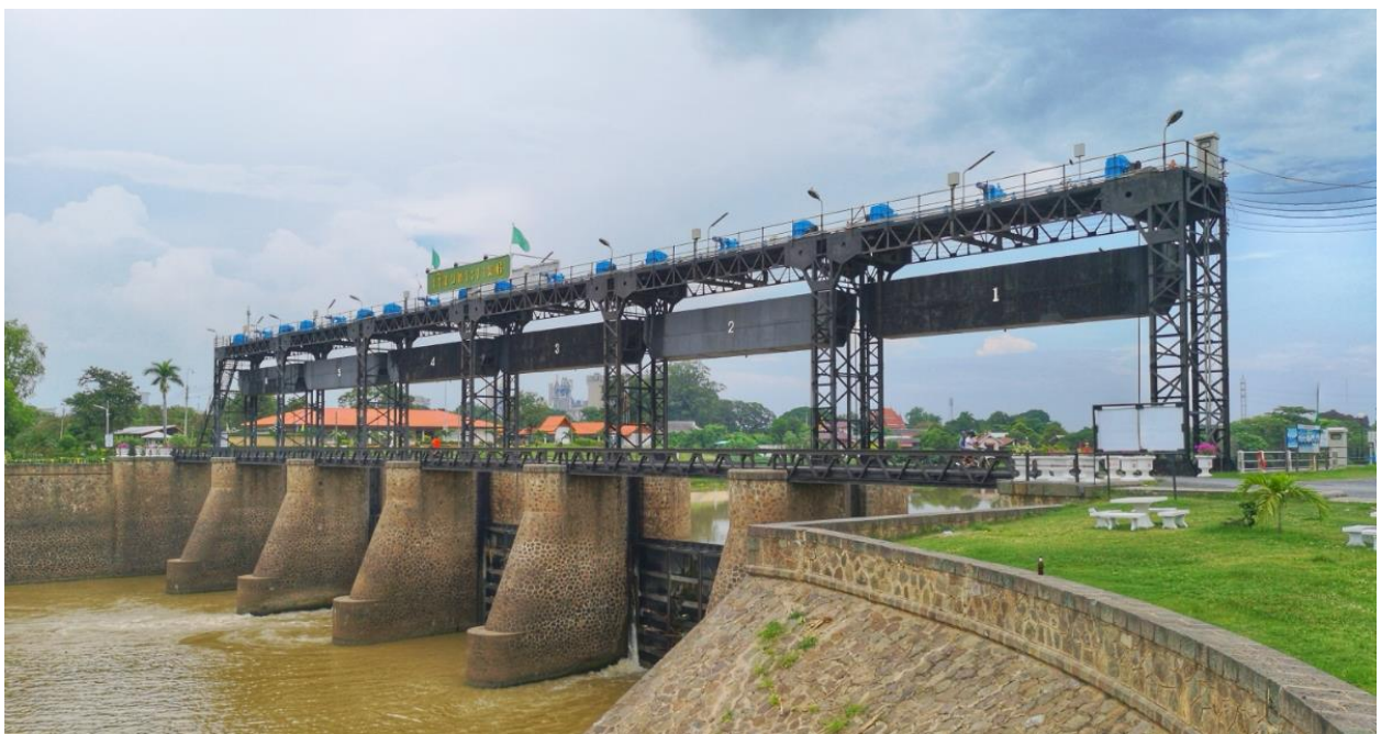
Photo: Rama VI Barrage/Dam, which began construction in late 1915 and was completed in December 1924. Its function is to supply water to 680,000 Rai of agricultural land in every part of the Rangsit canal area.

Prior to 1857, it was about managing people to suit the water conditions – either moving people away from or closer to water sources. The conclusion of the Bowring Treaty in 1855 led to demands for rice exports that required enough water for irrigation. Therefore, King Mongkut focused on developing canal systems in the Chao Phraya river delta for both irrigation and transportation. King Chulalongkorn, or Rama V, followed suit by upgrading them into more systematic irrigation and drainage systems, which led to the establishment of the Canals Department in 1902. Under King Vajiravudh, the Canals Department became the Barrages Department in 1914, as it expanded its work to construct the first large-scale barrage across the Pasak River in Ayutthaya, named the Rama VI Barrage.